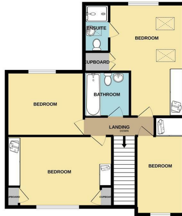
1ST FLOOR 842 sq.ft. (78.2 sq.m.) approx.